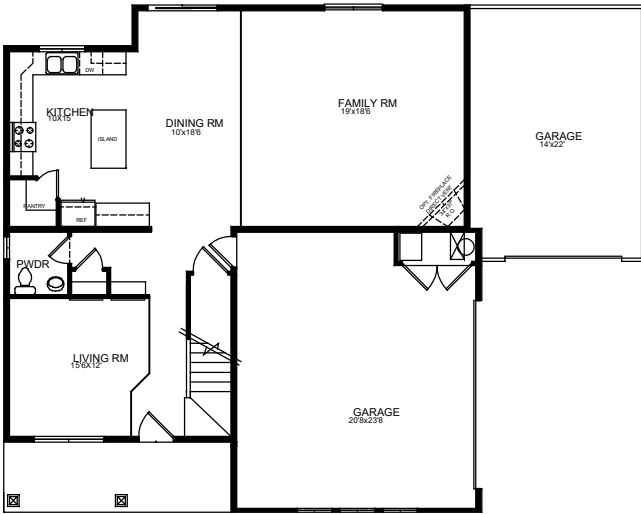
MAIN FLOOR PLAN 1102 S.F.

SQUARE FOOTAGE: 2442 TOTAL 2442 FINISHED 0 UNFINISHED